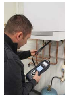
Ambient CO checking