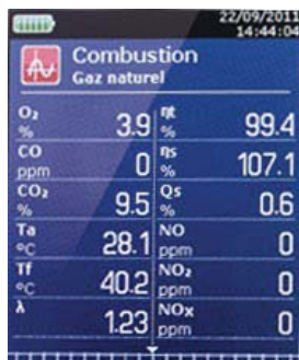
Example of analysis