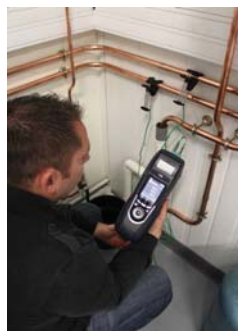
DHW network temperature