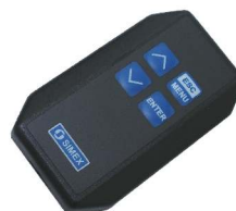
IR remote controller SIR-15