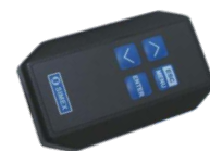
IR remote controller SIR-15