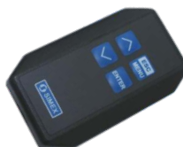
IR remote controller SIR-15