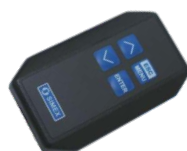
IR remote controller SIR-15