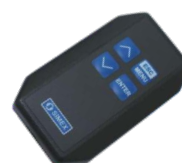
IR remote controller SIR-15